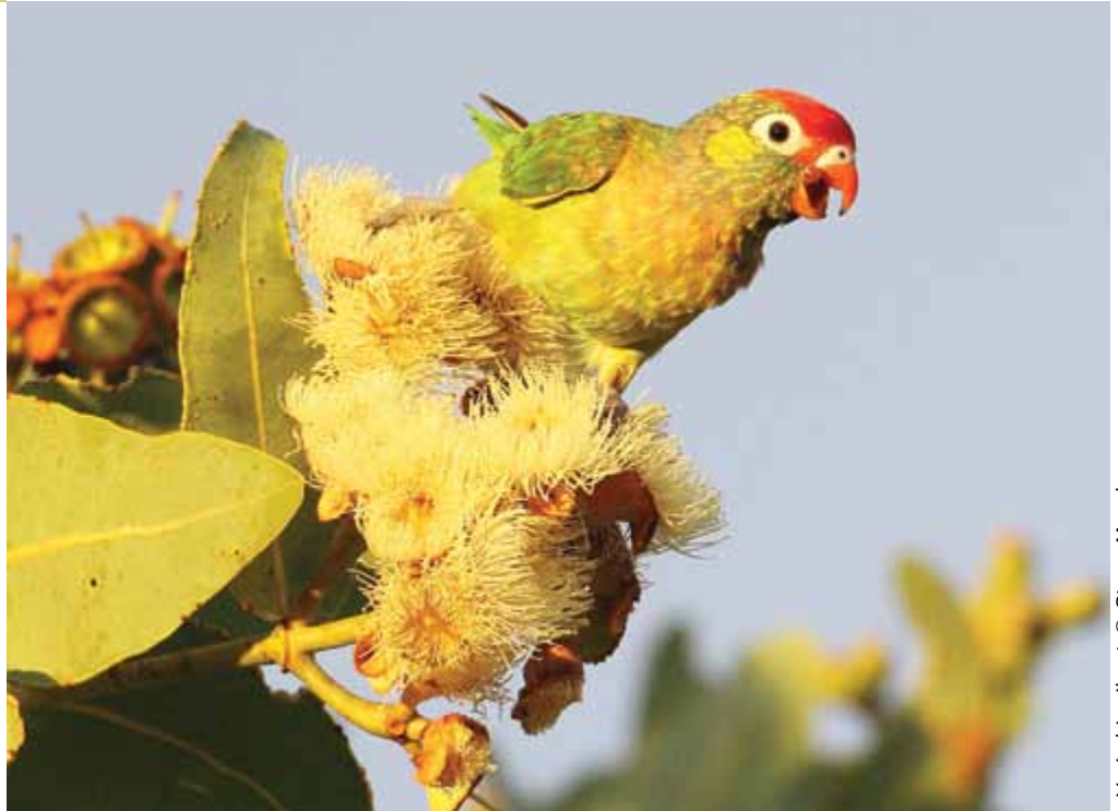
Varied Lorikeet