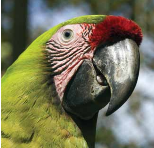
Great Green Macaw

today, we found a trend for these to outlive previous generations, indicating that captive care of psittacines is improving over time. Like most animals studied to date, larger parrot species generally live longer than smaller species (Figure 2). We found the difference in lifespan between large and small-bodied parrots might be only a decade.